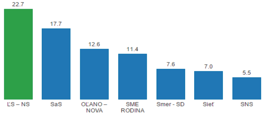
Scheme 1: Young voters' share of popular votes to political parties in 2016